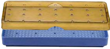
0103 Base, Lid &amp; Mat