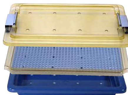
0207 Base, Lid, Insert Tray & Mat