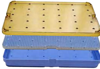
2023 Base, Lid, Insert Tray &amp; Mat