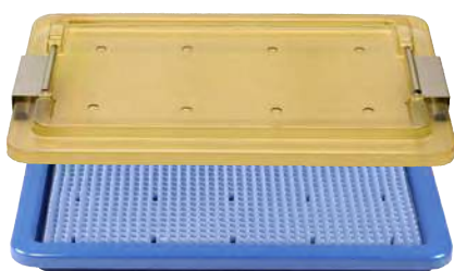
0105 Base, Lid & Mat